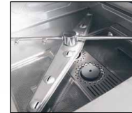
Integral tank filters