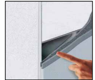
Thermal & acoustic insulation